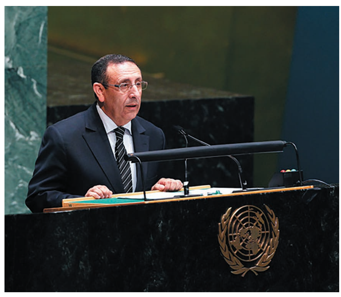
Ambassador Yousef Amrani addressing the United Nations